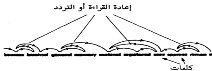
شكل ( ٤ ب ) حركة عين القارئ البطيء

“The untrained subject engages in regression (conscious rereading) and back-skipping (subconscious rereading via misplacement of fixation) for up to 30% of total reading time.”